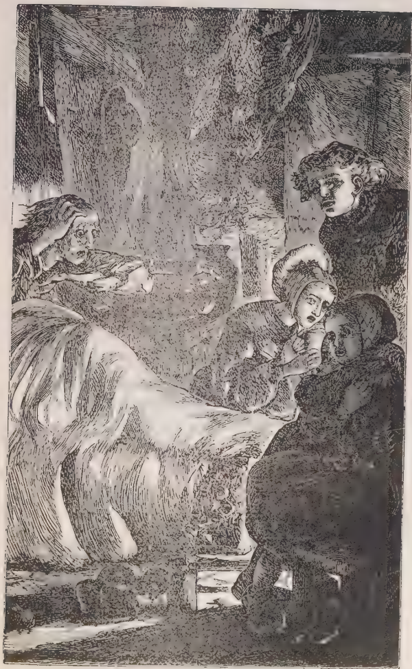
GABRIEL'S MARRIAGE. —AFTER DARK, Vol. XIX.