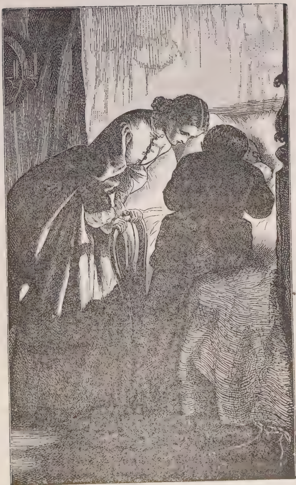
THE LADY OF GLENWITH GRANGE. —AFTER DARK, Vol. XIX.