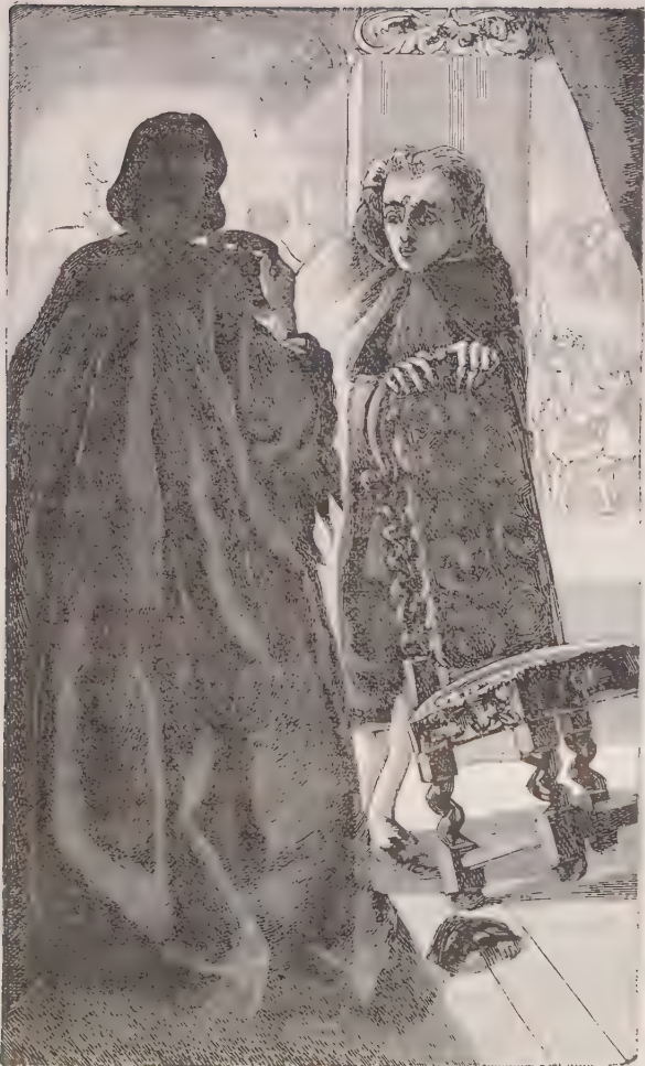
THE YELLOW MASK.